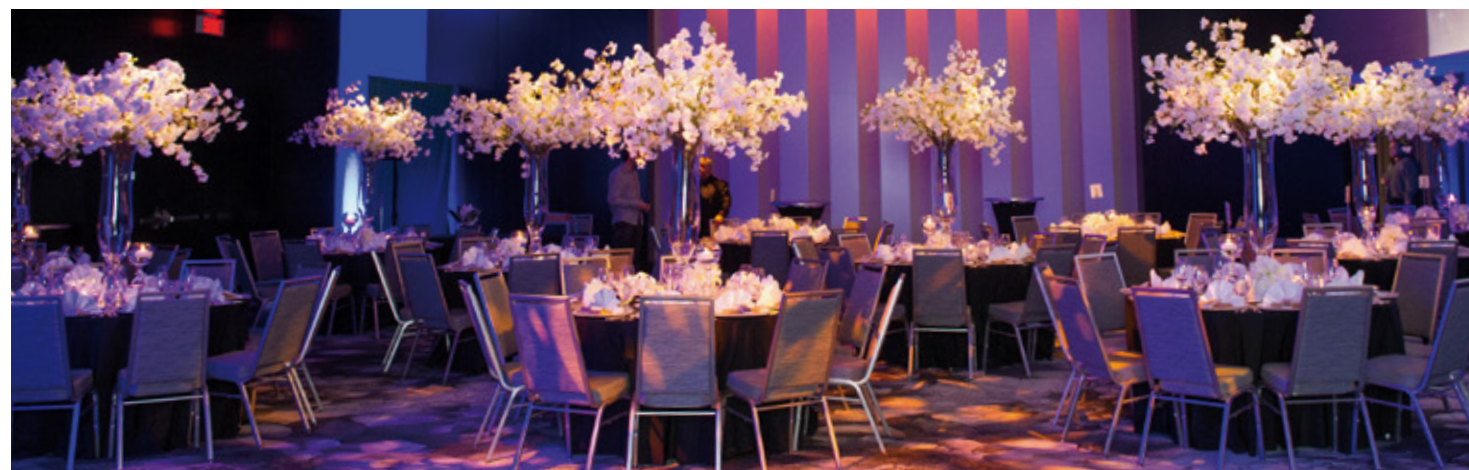
The A. & S. Nordheimer ballroom